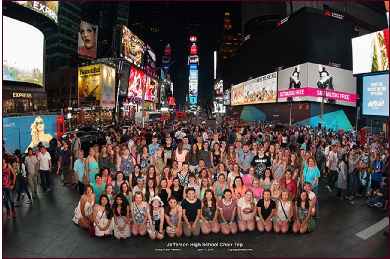
Jefferson High School Choir Trip Group Photo of Performers June 11, 2015