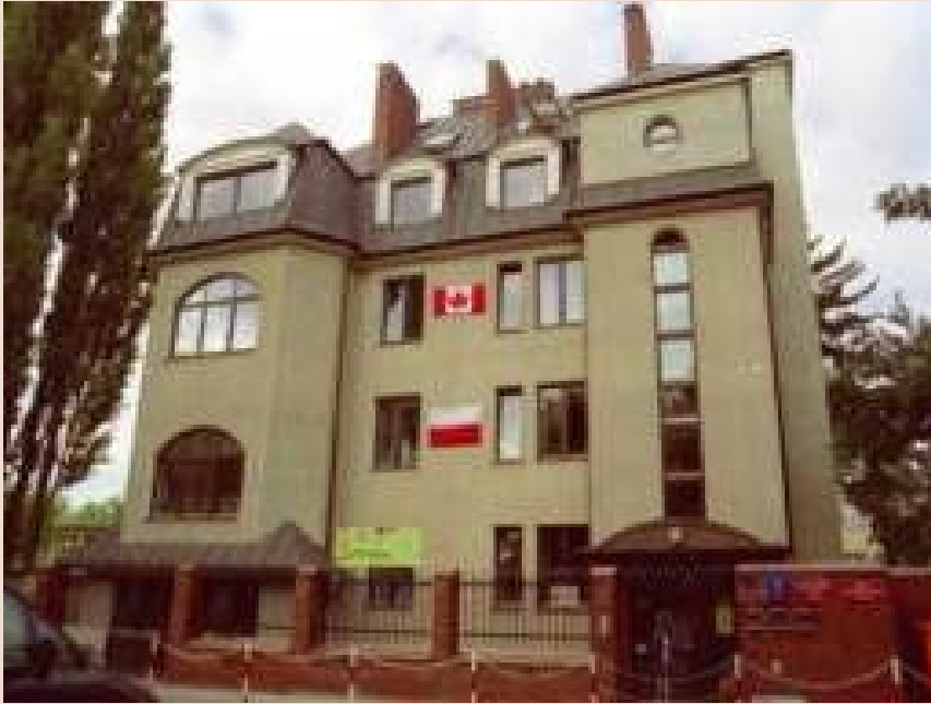
The Canadian School of Warsaw, Poland