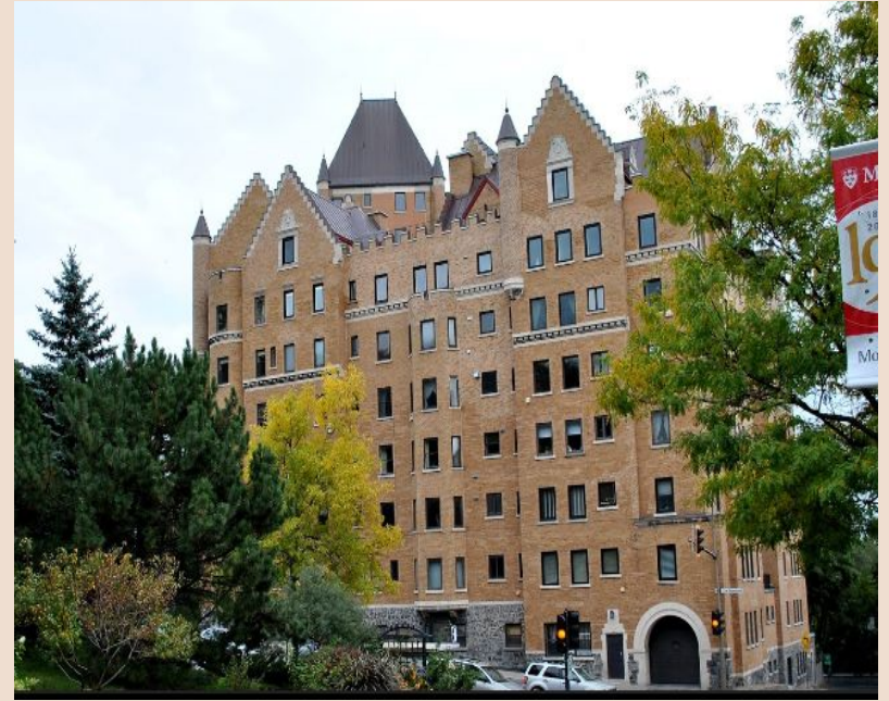
Ecs College Preparatory School, Westmount, Canada