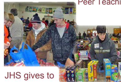
JHS gives to Christmas Neighbors