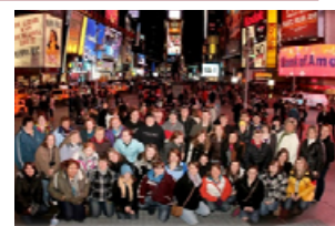
JHS Choir on New York Trip

ACADEC AFS Book Chess Dollars 4 Collars Drama Europe Equestrian FBLA & DECA FFA Forensics J-Club Latino NAHS NHS Psychology Skills USA Sportsman STAR Student Ambassadors Student Council Trapshooting Tri-M